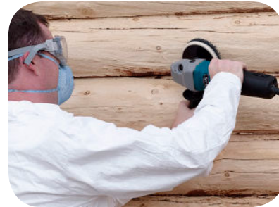
Sashco's Buffy Pad™ System or 3M® Non-woven Pad