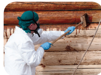
Immediately, vigorously back brush.