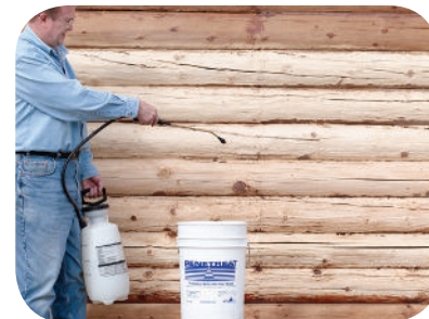
Apply Wood Preservative