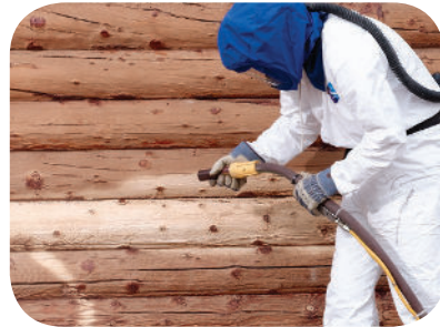
Corn Cob or Glass Blasting (Recommended method)

Prep the log surfaces using the method that will give you the finished appearance that you desire.