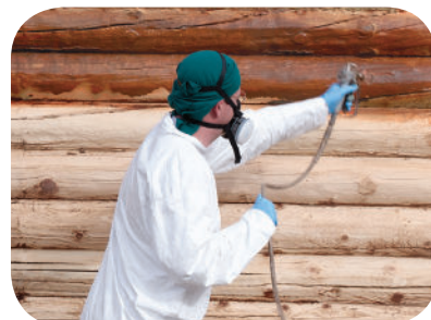
Spray on stain using a *Graco® 515 or 313 tip or equivalent.

Apply a borate wood preservative and insecticide, such as PeneTreat®, according to instructions.