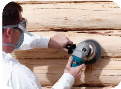
Osborn® Brush (Recommended method)

Once the logs are dry, hand finish the log surfaces to remove “felting” from power washing or to lessen the texture caused from media blasting.