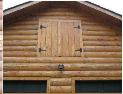
While water problems are never fun, a semi-transparent stain allows you to see developing problems, as shown with the tanning staining in this photo.

With a semi-transparent stain, you can see water damage beginning (as shown in the photo above). With paint, all of that is hidden, often until it's too late.