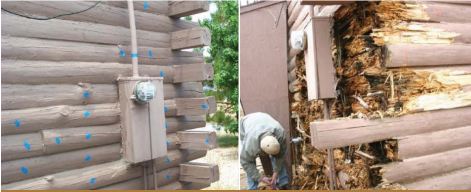
Note the blue tape on these logs. Those all mark areas of rotten wood. Before they knew it, they were digging out the entire corner of that house