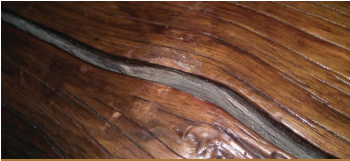
Checks and cracks like this can hold a lot of water and should be sealed to help prevent moisture infiltration.