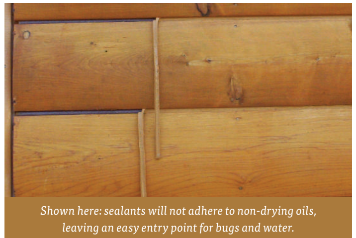
Shown here: sealants will not adhere to non-drying oils, leaving an easy entry point for bugs and water.

Another way to accomplish super-breathability is by using a non-drying oil as the main component of the stain. Unfortunately, these stains are incompatible with sealants and chinking, causing them not to adhere to surfaces coated with these non-drying oils. Sealants that don't adhere are easy access points for moisture (as shown in the photo below). Every log home needs some sealing, at the very least around doors and windows. This is why Sashco and many other manufacturers stand firmly against using non-drying oils, as well as silicones and waxes, on log homes, all of which prevent sealants from adhering properly.