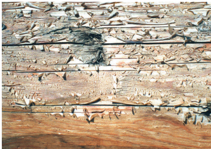
Too much water vapor pressure can result in stain that peels, as pictured.

On any log or timber structure, liquid water from many sources — dew, rain, runoff, backsplash, snow, ice, sprinklers, cleaning, etc. — will get onto the surface of the wood. Once on the surface, that water will soak into the wood, unless a good stain or coating is there to block it. Bare wood, weathered wood, weathered or failing stains and coatings, joints, fasteners, insect holes, and — perhaps especially — unsealed cracks and checks are all excellent places for liquid water to get past the coating and into the wood. Once in the wood, the liquid water will naturally soak deeper into the wood.