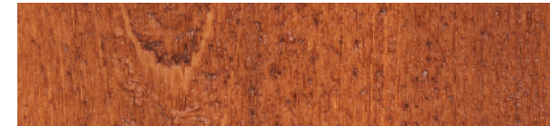
Red Tone Medium