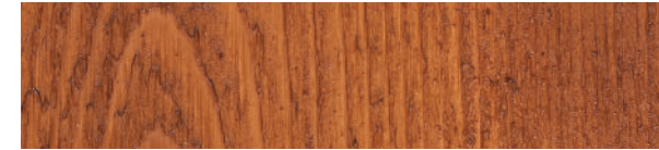
Brown Tone Medium