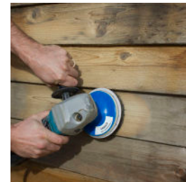
Buffy Pad System