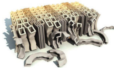
Without Colorfast™, lignin quickly deteriorates and the wood cells fall apart, turning yellow, then gray.