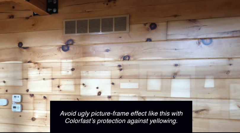
Avoid ugly picture-frame effect like this with Colorfast's protection against yellowing.