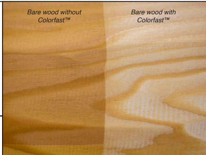
Bare wood with Colorfast™