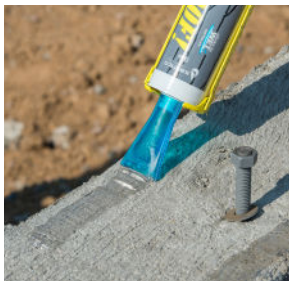
Sill plate seals