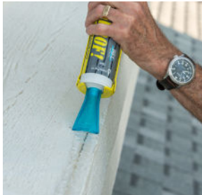
Window shadow boxes