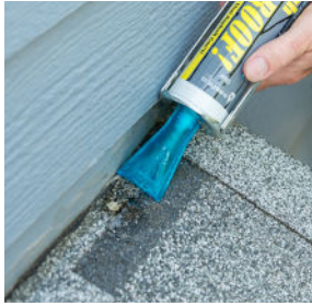
Over roof nails