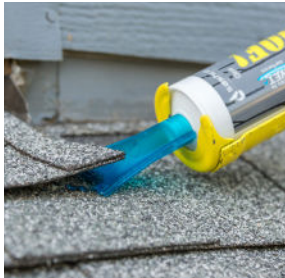
Tab down shingles