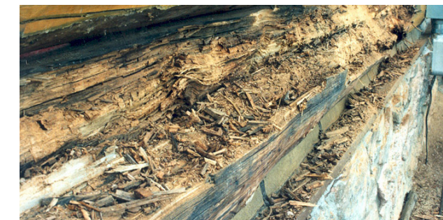
Tim-bor® helps prevent rot before it starts.

1. Read this entire Data Tec and the container label before applying Tim-bor®. It is a violation of Federal law to use this product in a manner inconsistent with its labeling.